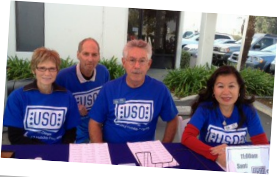
The San Diego USO held their annual Santa Store program